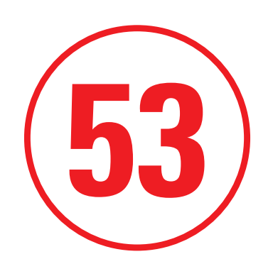
The average overall score of all participants was 53%